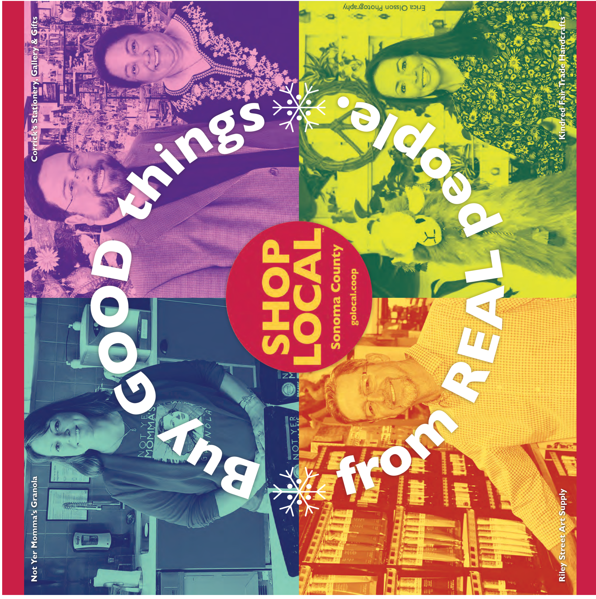
Corrick's Stationery, Gallery & Gifts